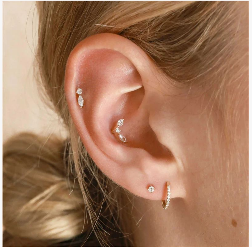
Lovely Flat Back CZ Diamonds Earrings3

This press release can be viewed online at: https://www.einpresswire.com/article/651032823