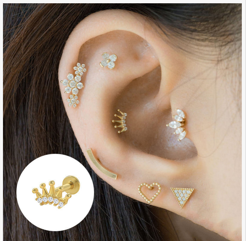
Lovely Flat Back CZ Diamonds Earrings2

innovation. Quality, sustainability, and customer satisfaction are the pillars of our brand.