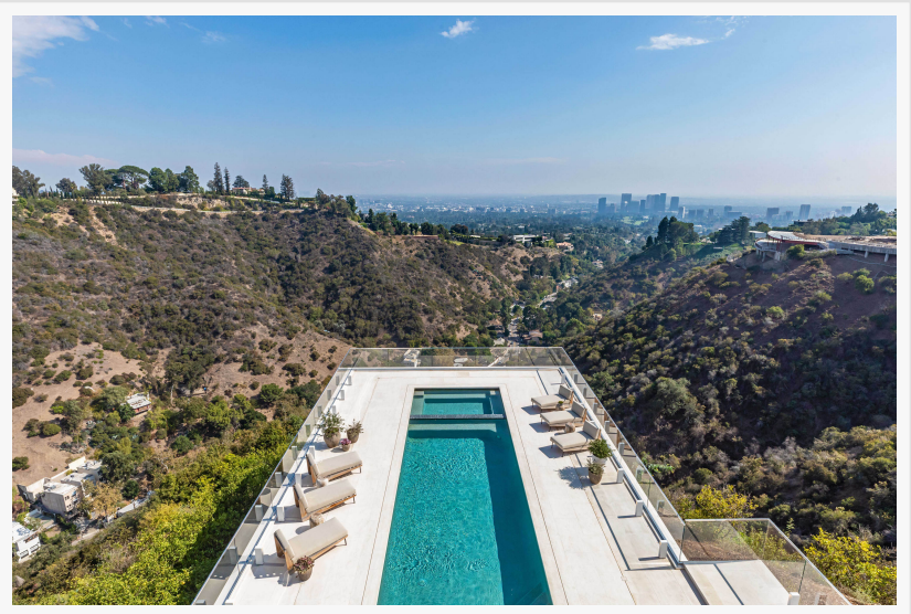
Bel Air's largest private orchard with 800± mature trees

Concierge Auctions is the world's largest luxury real estate auction marketplace, with a state-of-the-art digital marketing, property preview, and bidding platform. The firm matches sellers of one-of-a-kind homes with some of the most capable property connoisseurs on the planet. Sellers gain unmatched reach, speed,