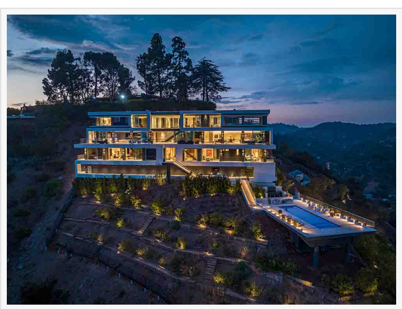
Bel Air Promontory | Bel Air, Los Angeles, California

NEW YORK, NEW YORK, UNITED STATES, August 21, 2023 /EINPresswire.com/ -- Sited on over 5.5 acres with jetliner views, <u>1250 Bel Air</u> <u>Road</u> is currently listed for $38.5 million. This property is set to auction with No Reserve in cooperation with Drew Fenton of Carolwood Estates. Bidding is scheduled to open 8 September and will be available via Concierge Auctions' online marketplace, <u>conciergeauctions.com</u>, allowing buyers to bid digitally from anywhere in the world.