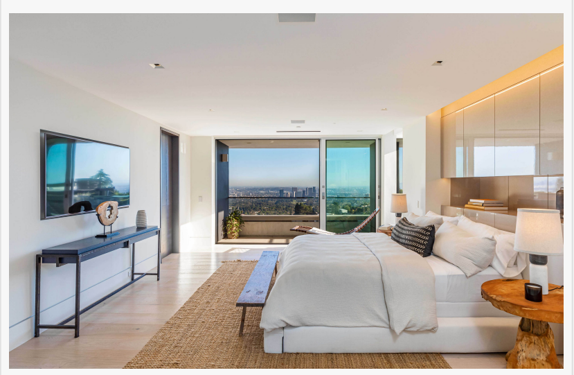
Hilltop in Bel Air with unobstructed LA and coastal views