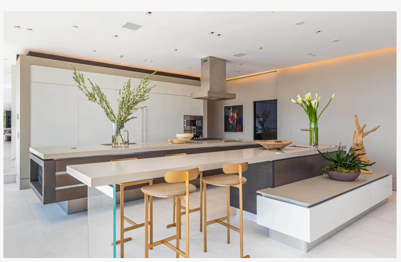
Contemporary architectural gem with stunning finishes