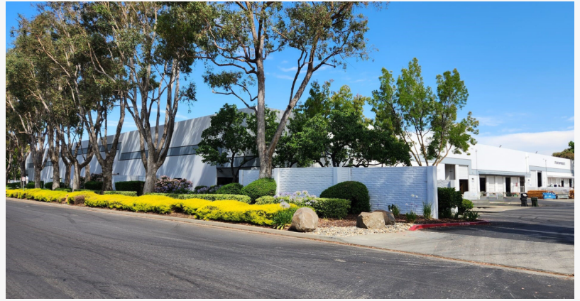
Exterior view of CONTROLTEK's Livermore, CA facility

increase capacity and improve product quality while reducing turnaround times. This expansion also includes additional space for warehousing and inventory management processes. As a result of these additional capabilities, CONTROLTEK can ensure that their products remain competitively priced while still meeting all customers' expectations for quality assurance.