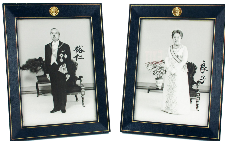
Pair of photos in the original Imperial frames of Emperor Hirohito and Empress Kōjun of Japan, boldly signed in Japanese calligraphy (est. $7,000-$8,000).

Lot 330 is a two-page typed document signed by Winston Churchill, dated June 9, 1938, in which Churchill signs on to write about Russia but stops to placate Stalin. The memorandum was an agreement with his publisher for the rights to Churchill's Europe Since the Russian Revolution, a project later abandoned because of Churchill's obligations as wartime premier. Pencil notations are in the margins (est. $5,000-$6,000).