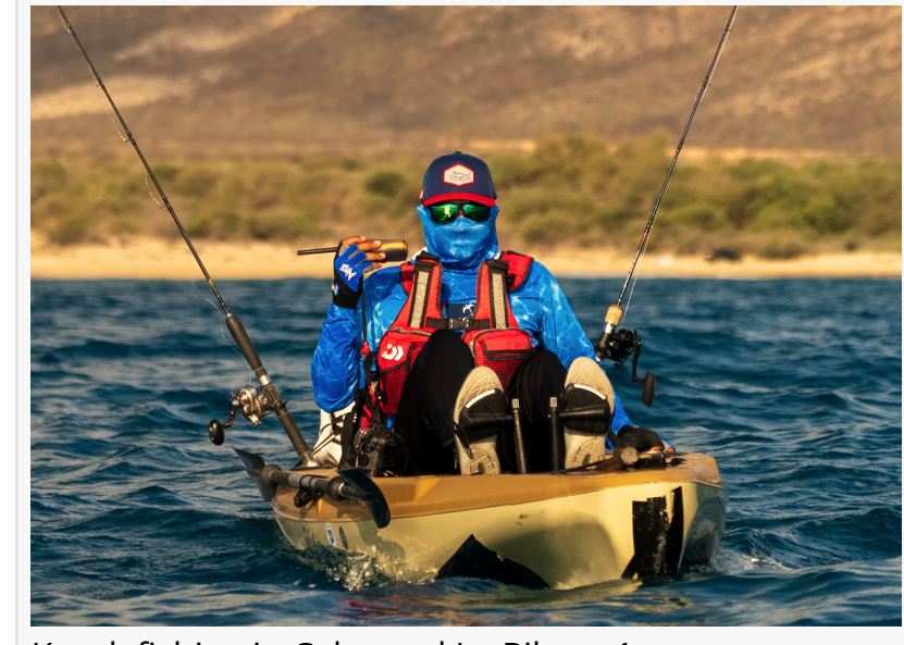
Kayak fishing in Cabo and La Ribera 1

About Tag Cabo Sportfishing For over a decade and a half, Tag Cabo