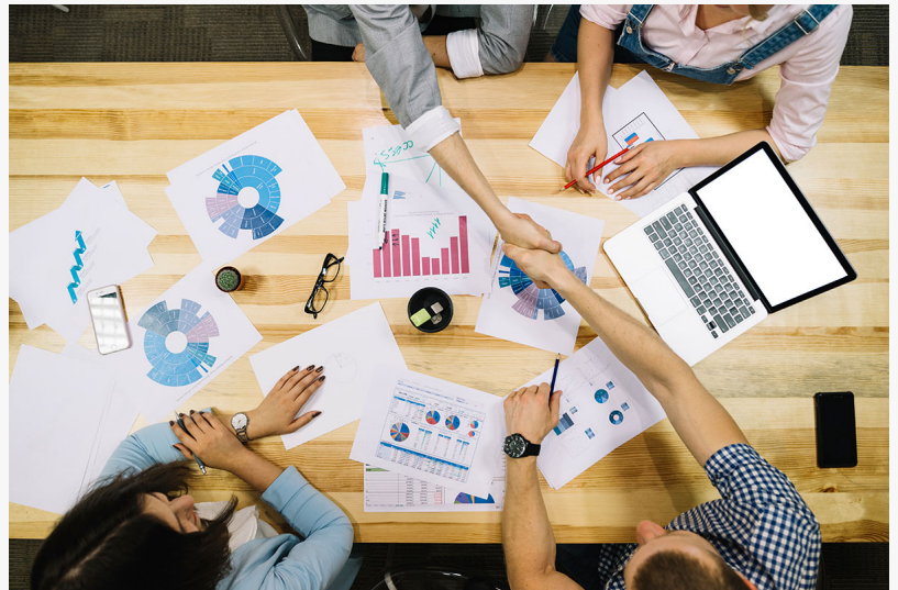
Negative Link Removal Services