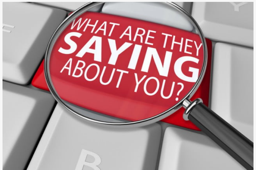
Remove negative links