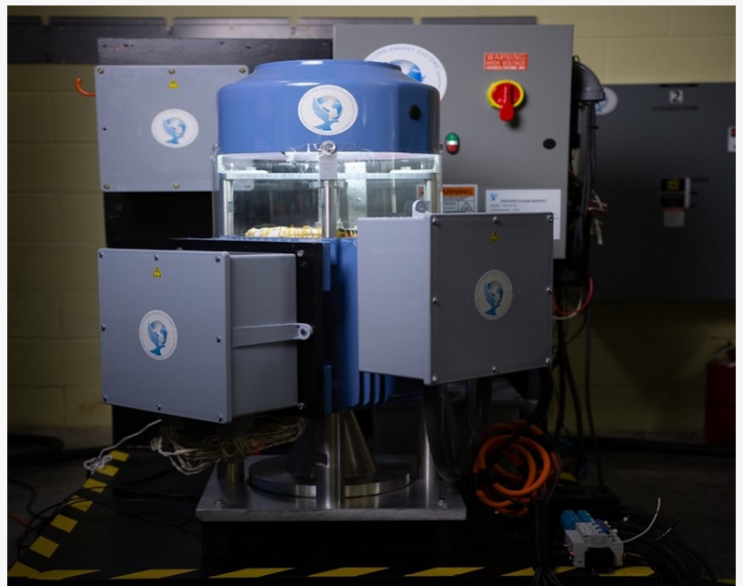
$ASRE Holcomb Energy Systems, inc.