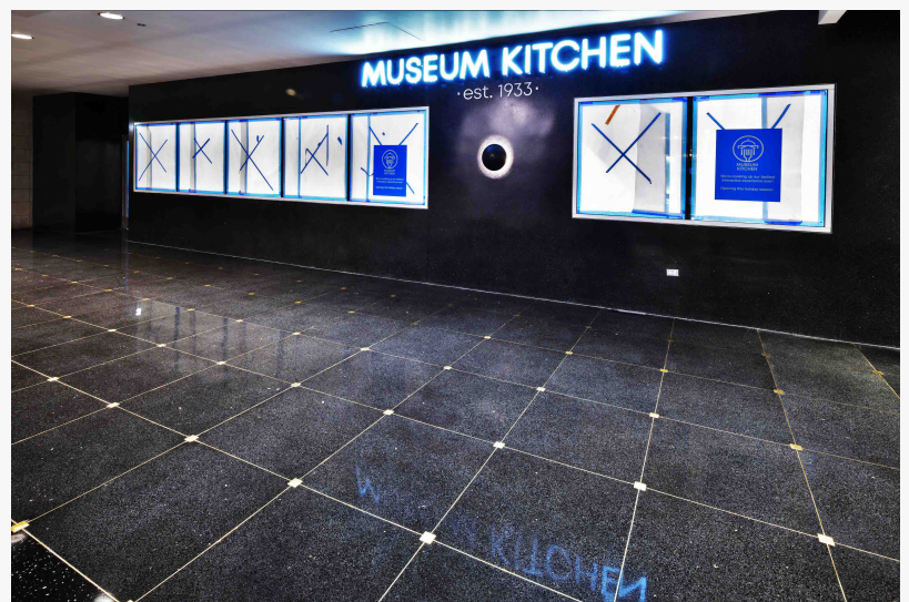
BRASS INSERTS from the previous floor were repurposed in the award-winning floor.

walls; another 450 square feet were laid on the nine-foot-high ceilings. In an elegant example of in situ recycling, two-by-two-inch brass inserts from the existing terrazzo were repurposed in the new floor.