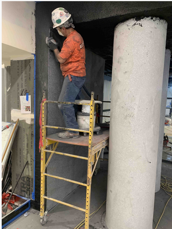
TERRAZZO was troweled and ground by hand on columns, walls, and ceilings.