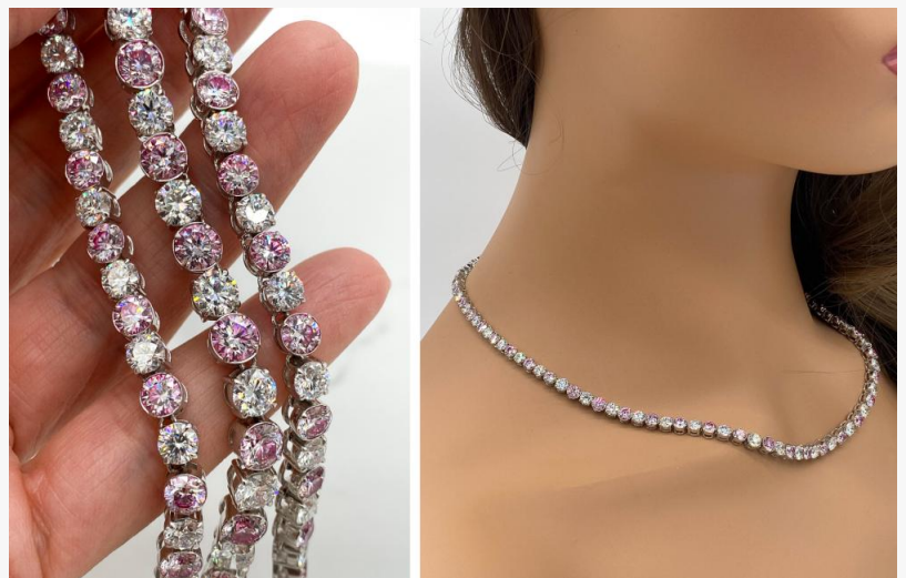
Dazzling 19ct pink diamond and 19.02ct white diamond necklace set in 18kt white gold weighing 49g, 19 ½ inches long, accompanied by 100 GIA certificates (est. $286,000-$290,000).