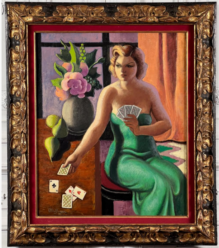
Oil on canvas painting by Jean Metzinger (French, 1883-1956), titled Femme Aux Cartes , with a Sotheby's label on verso and Sotheby's May 2, 1996 auction catalog (est. $100,000-$200,000).