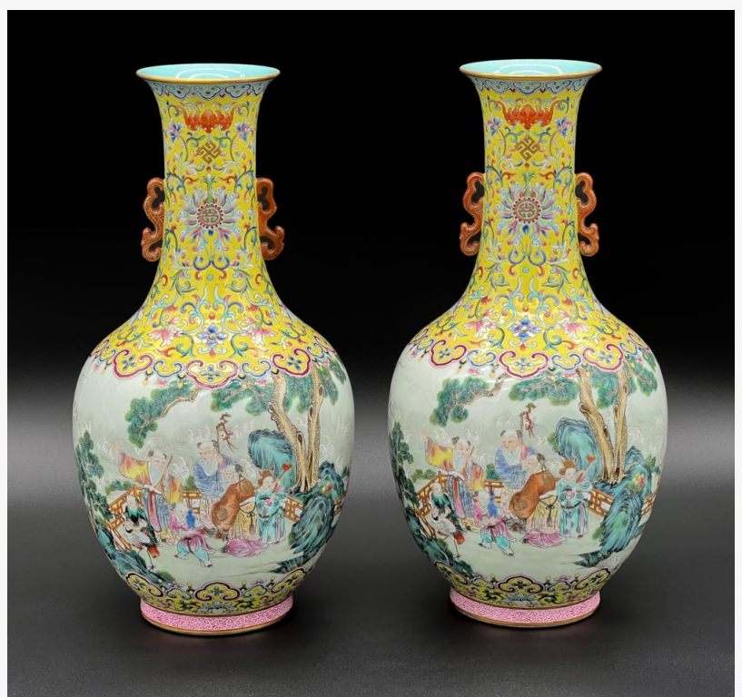
Pair of Chinese famille rose vases – possibly Jiaqing, early 19th century – having bodies with continuous landscapes of elders and children by the sea, 14 inches tall (est. $75,000-$150,000).

Other noteworthy bronzes include one of a standing dancer disrobing titled Nureyev, Third Life , by Richard MacDonald (Calif., b. 1946). The 1998 piece is signed and numbered (41/90) on the base and is 30 ½ inches tall, including the black marble socle (est. $10,000-$15,000); and a drum circle with Apache elders by Allan Houser (Am./Apache, 1914-1994), titled Forty-Nine (1978), signed lower back, from an edition of 20, 13 inches tall on a walnut base (est. $20,000-$30,000).