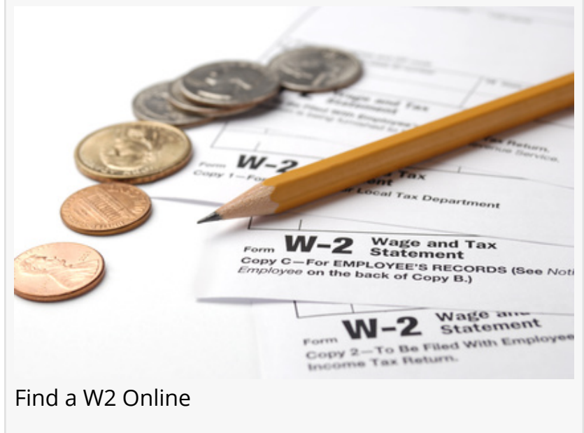
Find a W2 Online