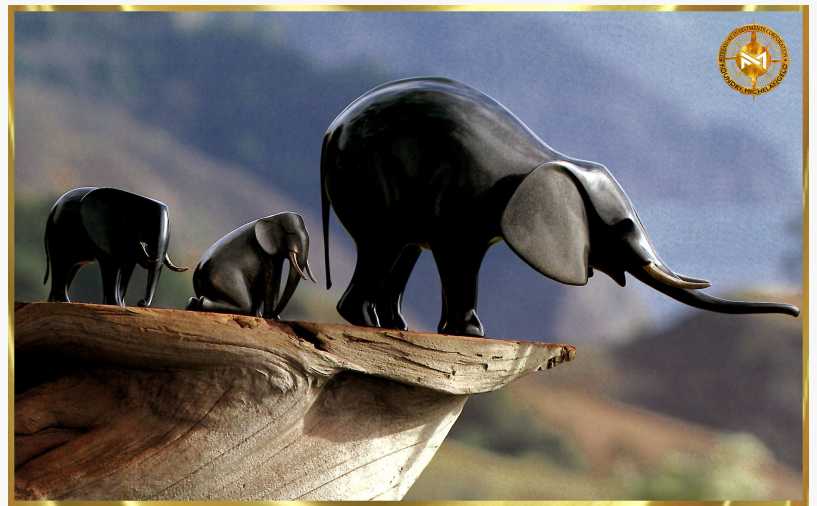
Elephant and Babies by Loet Vanderveen

This press release can be viewed online at: https://www.einpresswire.com/article/651454247