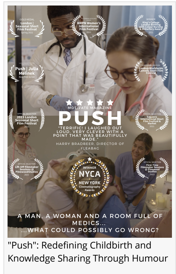
"Push": Redefining Childbirth and Knowledge Sharing Through Humour

At the core of this concise cinematic masterpiece lies a powerful objective—to catalyze a reconsideration of the callous attitudes frequently displayed towards those confronting mental health issues. "Unseen" seeks to underscore that for individuals enduring such struggles, their challenges are just as tangible and significant as a "broken leg." Employing its unique narrative approach, the film encourages viewers to approach mental health challenges with the empathy, validation, and seriousness they warrant. In doing so, "Unseen" effectively challenges the deeply