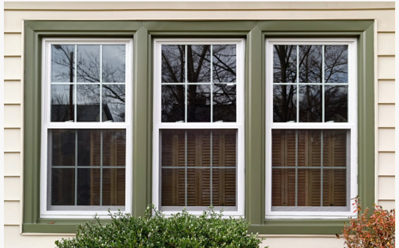
New replacement windows tax deduction