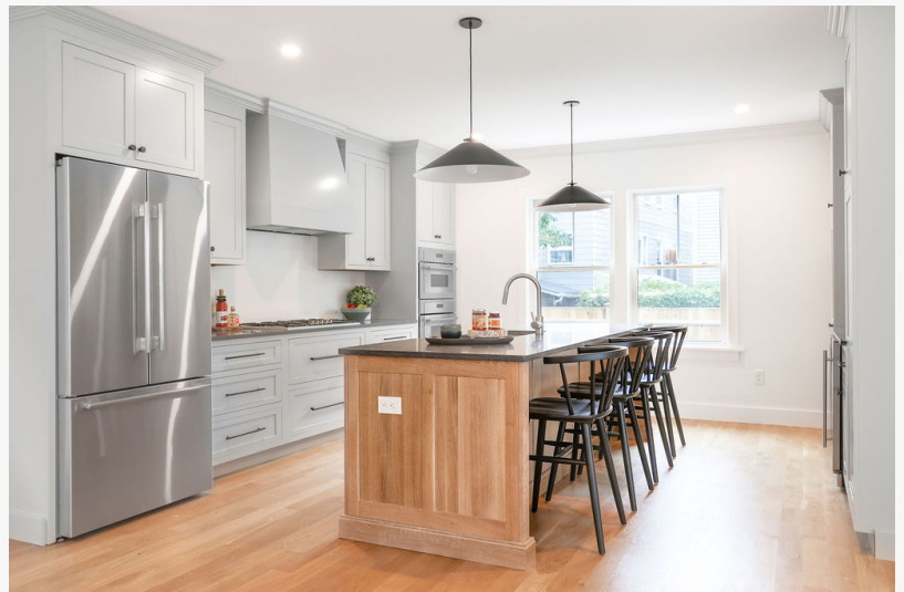
Luxury Kitchen in Davis Square

The luxury condos, like the exquisite units at 20 Jay St, in Davis Square, now available for