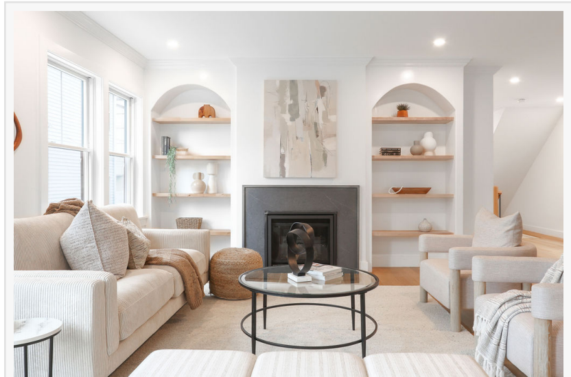
Elegant living room with gas fireplace with accented archway bookshelves

Somerville, Massachusetts has long been a vibrant and diverse city, known for its unique character and welcoming atmosphere. Over the past decade, the city has undergone a remarkable transformation, welcoming a wave of life-science and biotech companies and establishing itself as a key player in the innovation sector. This shift in the city's economic landscape has attracted a highly educated and forward-thinking workforce.