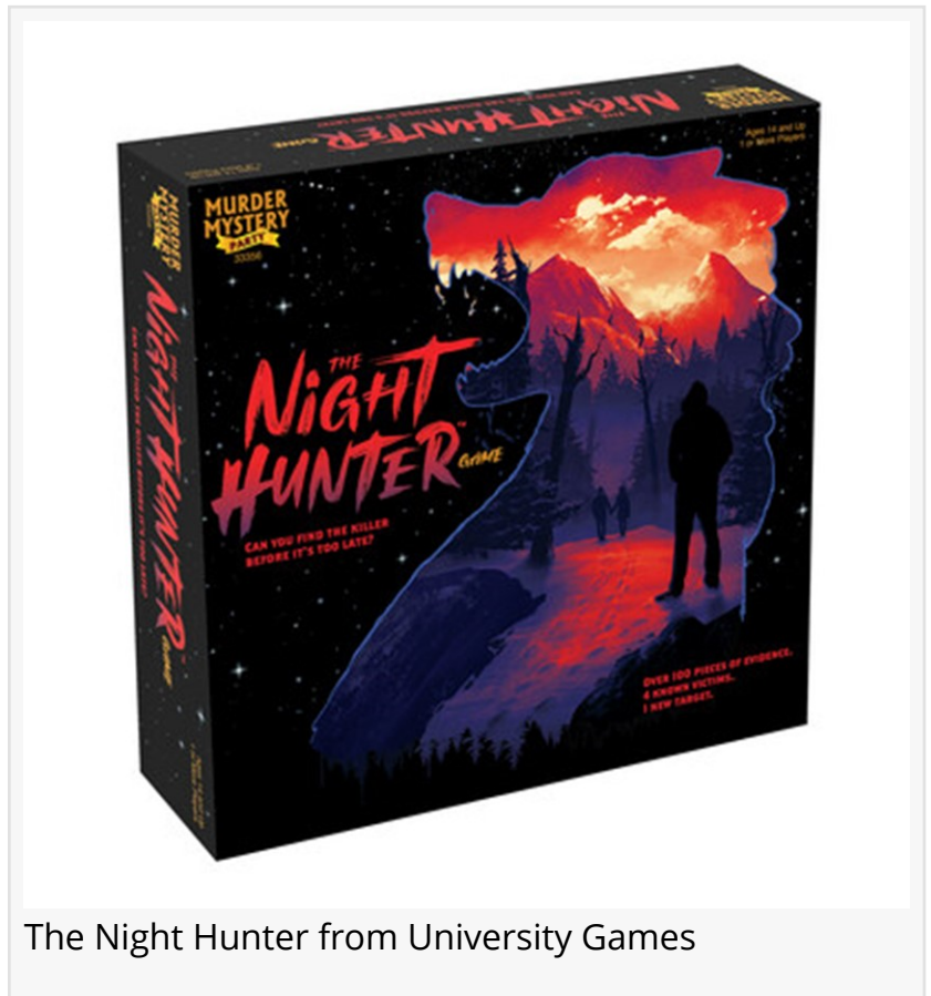
The Night Hunter from University Games