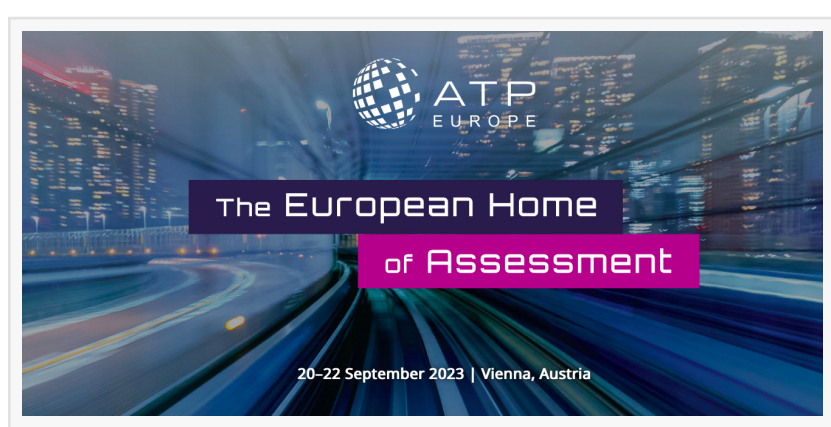
E-ATP 2023 Banner

WASHINGTON, DC, USA, August 24, 2023 /EINPresswire.com/ -- From the world of disadvanaged refugees, to the underworld of cyber crime, Europe-ATP's keynote speakers will provide startling insights and real solutions on how emergent technologies can be used to address the very real challenges impacting educational and