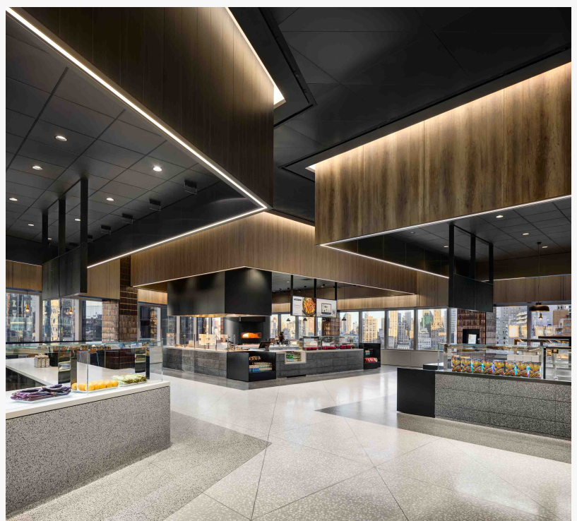
DEUTSCHE BANK CENTER boasts numerous amenities and work spaces.

Terrazzo was installed in the public spaces during a remodel of the 2004 landmark building, One Columbus Circle, formerly Time Warner Center. At 90,000 square feet, the hand-trowelled installation is considered the city's largest Venetian (with larger-than-standard aggregates) epoxy terrazzo application, according to the installer.