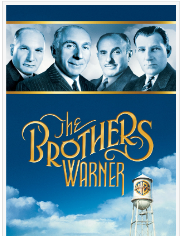
Celebrating Warner Bro.'s 100 Year Anniversary