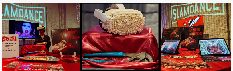
tooth encrusted hmd and luma pads by leia inc.

Shot on a custom camera from Radiant Images, UHD stereoscopic photography, 360 projection and high order ambisonics converge to deliver a serene and unsettling journey that Film Threat calls inspired by Tarsem and Jodorowski and is unprecedented in the XR / VR landscape. "I want people to feel like they are inside a movie. Not a game." said Sims.