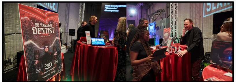
Sims greets fans at AGBO