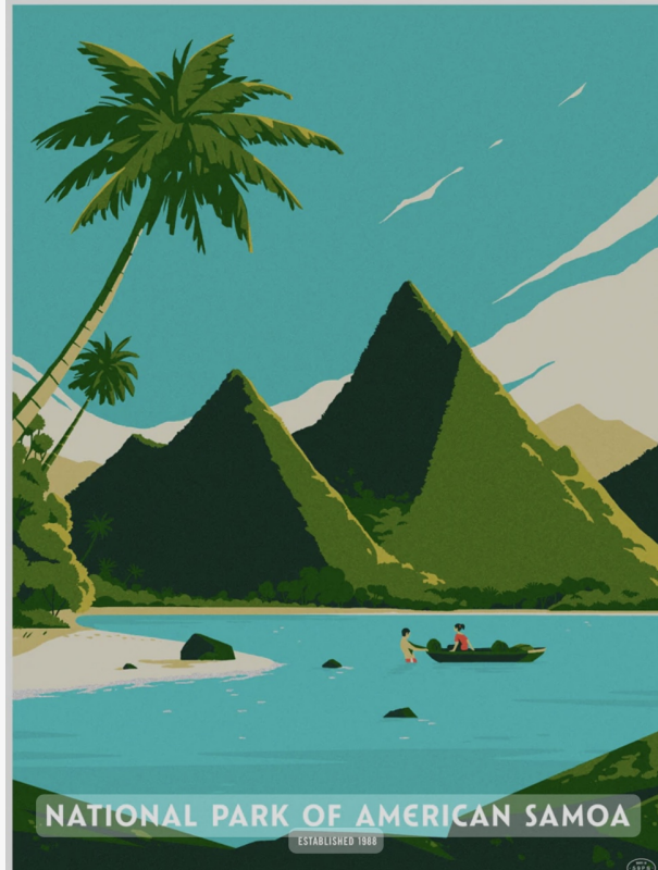
American Samoa, LLC