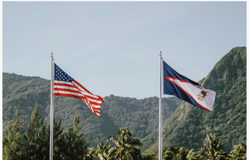
American Samoa Territory of USA

For more information, visit americansamoallc.com or americansamoaregisteredagent.com :