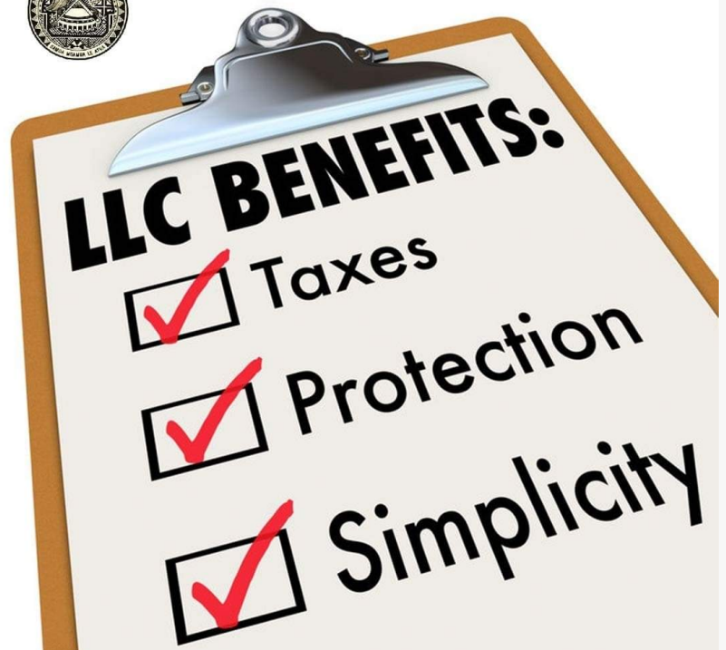
American Samoa, USA LLCs are Simple and Easy Online!