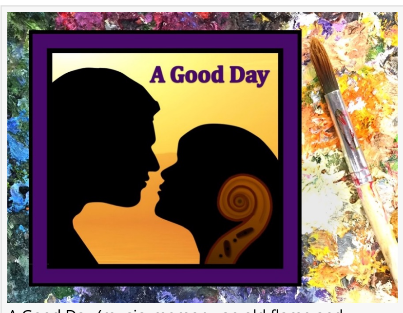
A Good Day (music, memory, an old flame and Alzheimer's)

NEW YORK, NY, USA, August 28, 2023 /EINPresswire.com/ -- <u>A Good Day</u>, an original and uplifting musical, by playwright/composer, Eric B. Sirota, will be presented by The Shawnee Playhouse (in Shawnee on Delaware, PA) from September 9th through September 24th. Directed by Midge McClosky, this authentic musical illuminates the therapeutic and healing powers of music, art and movement on the splintered and fragmented lives of