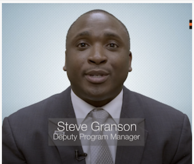
Program Manager of The $7.5 Billion Dollar METRONext Moving Forward plan