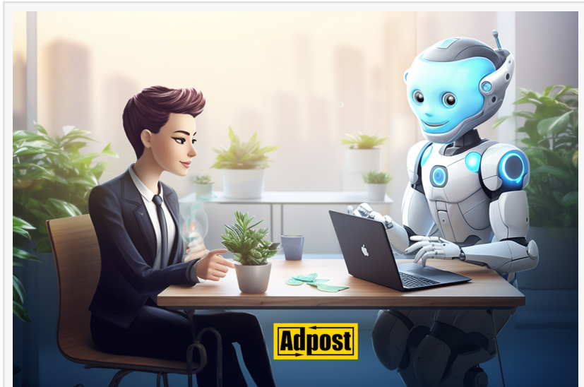
Blending the future with the familiar: An intimate portrayal of human interactions with Adpost's AI chatbot, set against a modern workspace

expensive. Additionally, the constant need for updates, fine-tuning, and data management further inflates costs. This has meant that the transformative power of AI in enhancing customer interactions remains, for many, just beyond reach.