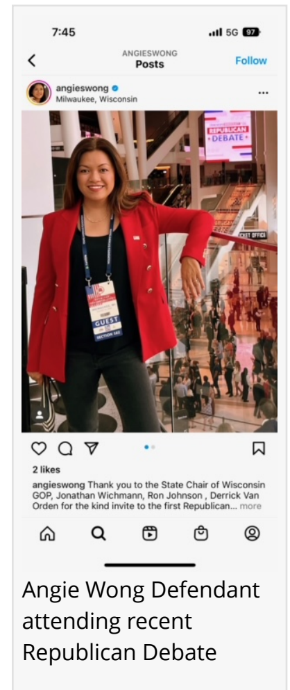
Angie Wong Defendant attending recent Republican Debate

This press release can be viewed online at: https://www.einpresswire.com/article/651935947