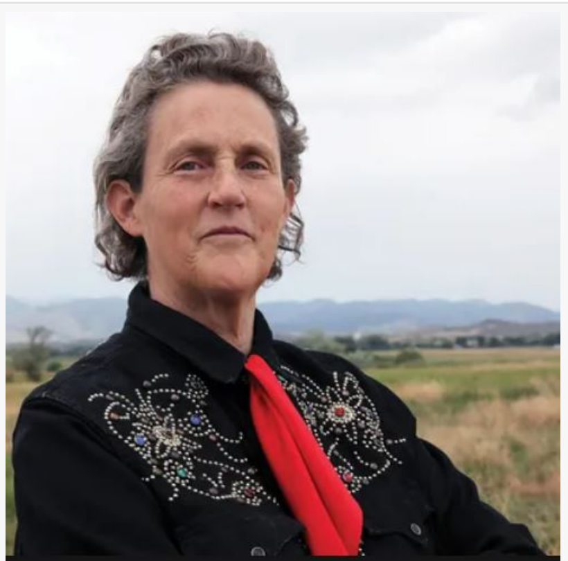
Dr. Temple Grandin 2023 Lending Your Voice Award Recipient

ABOUT THE ALL GHOULS GALA The All Ghouls Gala is an adult Halloween fundraising event benefiting Autism Care Today (ACT) On Oct 28th, 2023 beginning at 7:00pm at an