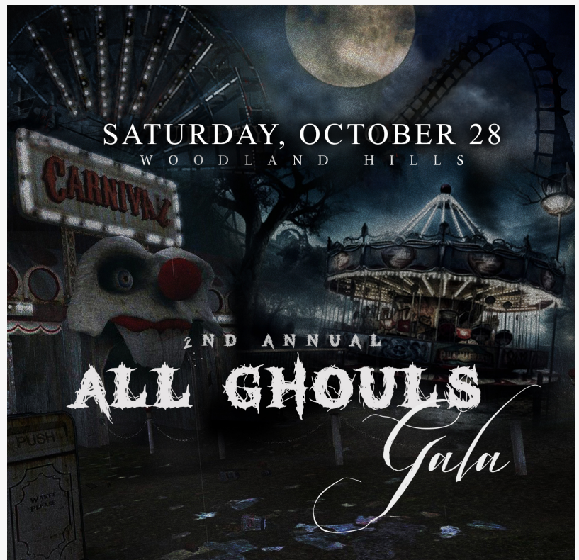
October 28, 2023 The Second Annual All Ghouls Gala to benefit Autism Care Today!