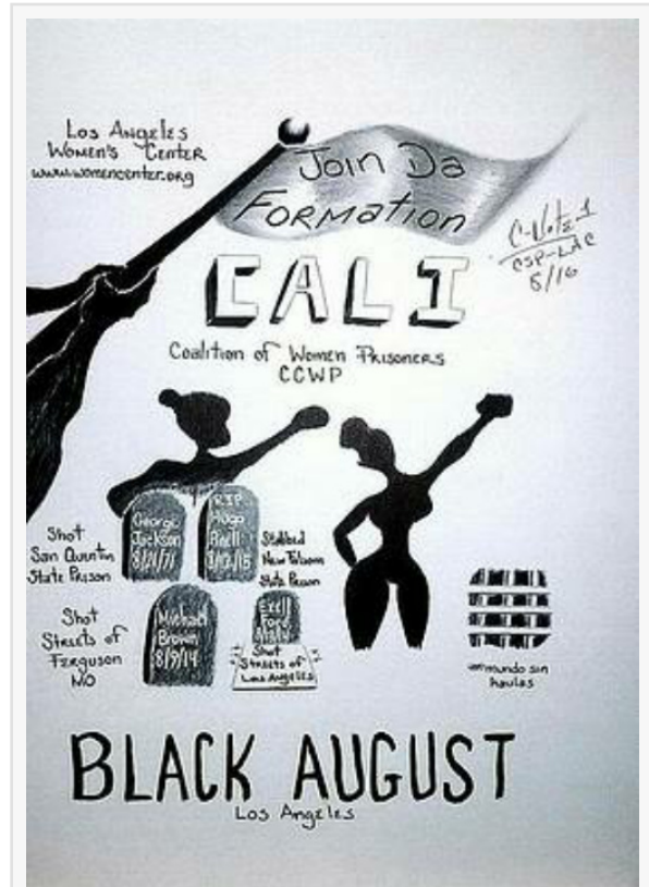
Prison Artist C-Note, Black August - Los Angeles (2016)

Each tiny work seen in the Statue of Liberty outline was