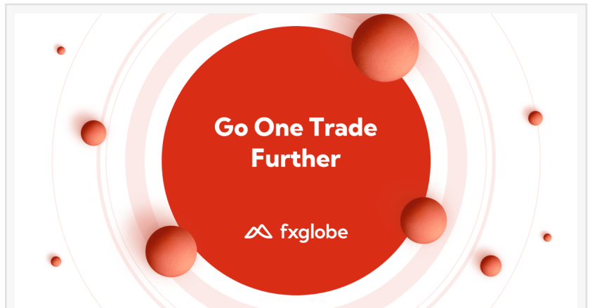
One trade further with FXGlobe

This "lifetime value" income stream incentivizes sustainable partnerships.