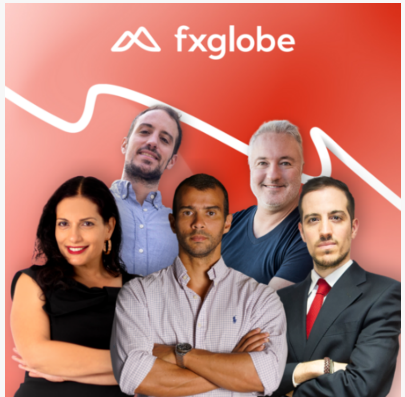
All five ambassadors of FXGlobe