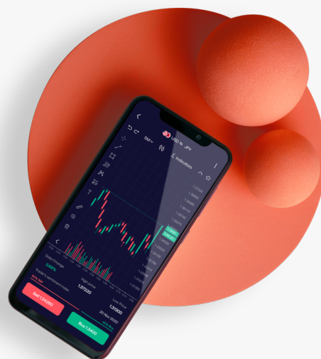
FXGlobe.io Mobile trading

Aspiring introducing brokers worldwide can learn more about FXGlobe's partnership opportunities by visiting https://fxglobe.com/become-a-partner/ .