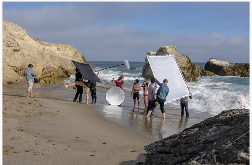
Filming Shellfish on Malibu Beach