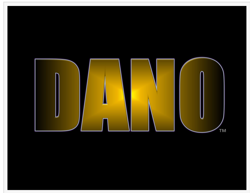
The free streaming tv platform created by filmmakers.

3. Monetization from the Start: Unlike traditional film distribution channels that often require significant investment and negotiation processes, DANO Network enables students to monetize their films right from the start. By incorporating non-intrusive ads into their films, students can generate revenue while maintaining the integrity of their artistic vision. This unique approach empowers students financially and encourages them to pursue their passion with greater enthusiasm.