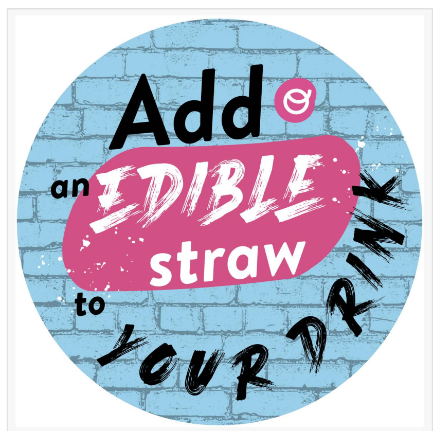
Add an Edible straws to your drink

The Turning Tide on Straws: An Industry-Wide Wake-up Call