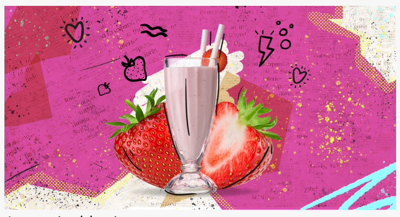
A sustainable sip