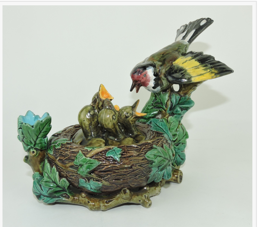
This Minton majolica trinket box, circa 1875, modeled as a bird's nest, with a single leafage posy holder and a large mother goldfinch looking down on hungry hatchlings, made $13,530.

A George Jones majolica butterfly ring stand, circa 1875, modeled as an oval dish of green leaves with a large white blossom to the center and with a butterfly at each end forming handles, on green leaf supports, earned $5,228; while a Minton Majolica 6-well cobalt blue oyster plate, circa 1875, modeled as a circular plate with cobalt blue wells separated by shells and seaweed, the turquoise circular central well surrounded by conch shells, achieved $2,214.