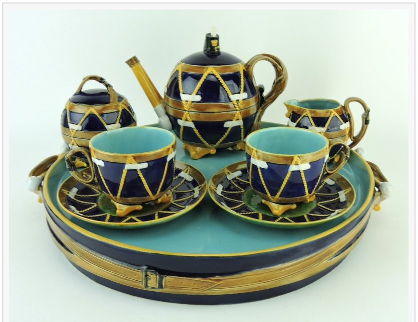
This rare George Jones majolica "Drum" cabaret set from around 1875, one of only two known complete sets, gaveled for $31,625 to take runner-up top lot honors.

A Minton majolica menu holder, circa 1865, modeled as a heron beside a bottle peering down at a fox, a fish