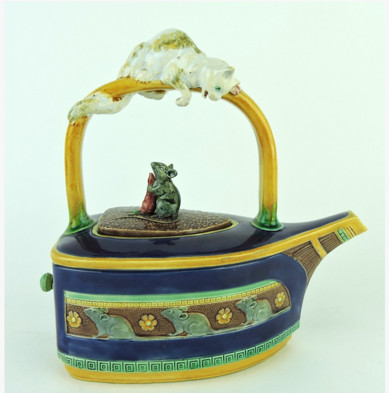
Minton cobalt teapot, modeled as a flat iron with a frieze of mice to the sides and a large white cat wrapped around the handle looking down at a mouse holding a carrot ($46,125).