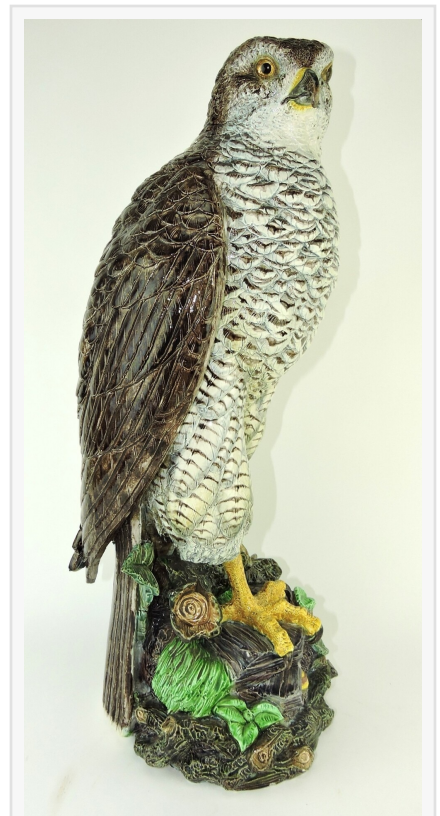
Hugo Lonitz majolica model of a hawk, created around 1875, with glass eyes, perched on a rocky ground with ferns and branches on an entwined branch base, 24 inches tall ($49,200).

Also from George Jones was the only known pair of Tulip & Butterfly candlesticks, circa 1875, each modeled as an upright tulip and large green leaves forming the body, with a blossom forming the candle holders, a butterfly below on a circular earthy ground. These formed part of a dressing table set, all designed around blossoms and butterflies ($25,830).