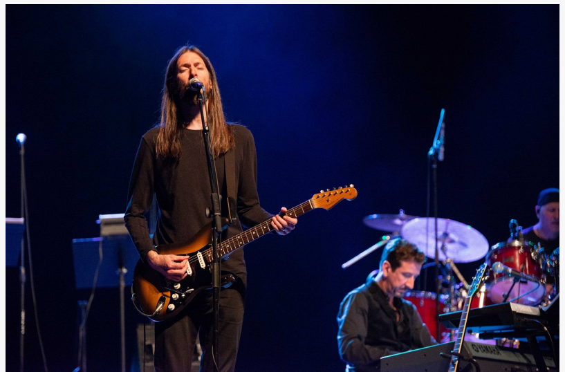
Classic Albums Live - Fleetwood Mac