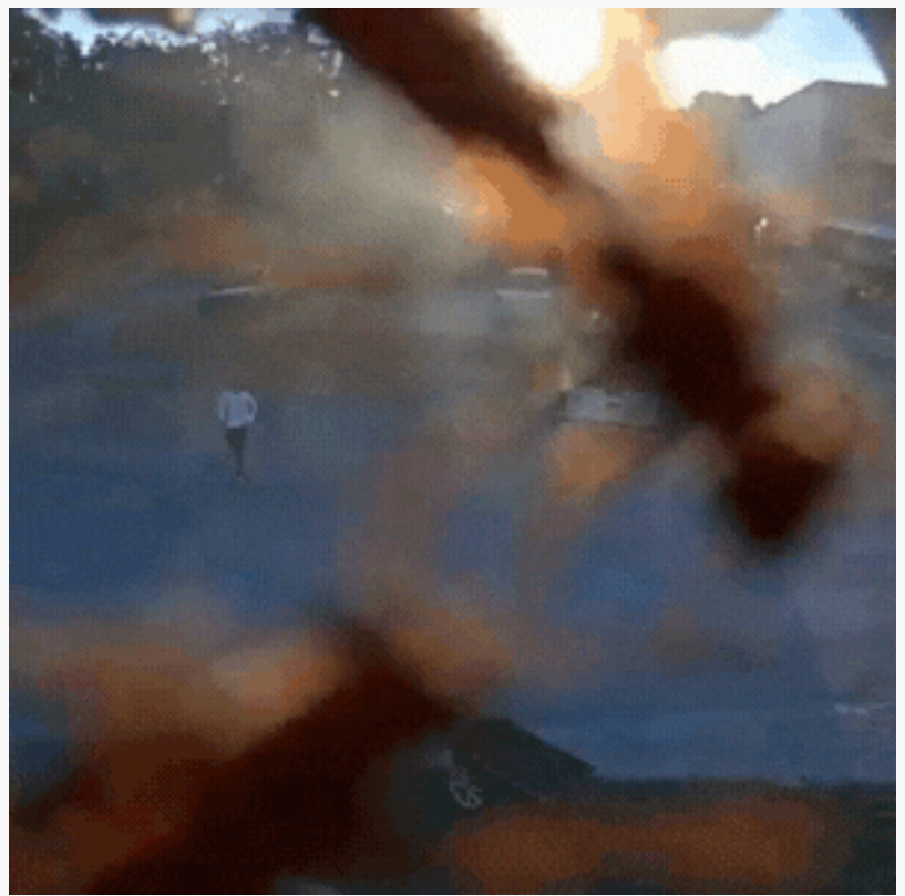
Person Detected Behind Massive Wasp