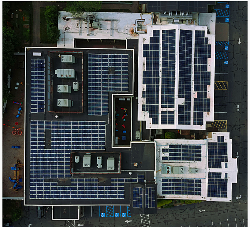
Temple Beth Shalom's 272.7kW Rooftop Solar Arrays