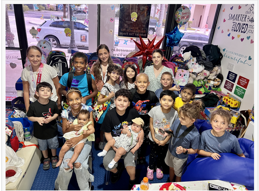
Children battling Childhood Cancer and their siblings at the Mystic Force Heroes Hangout