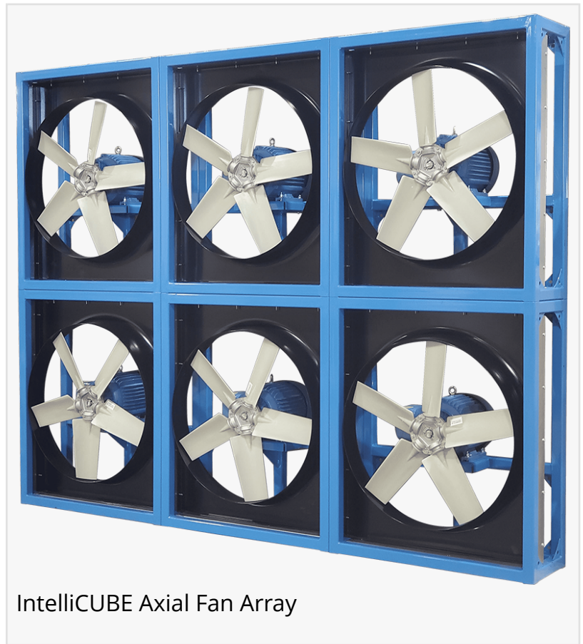
IntelliCUBE Axial Fan Array