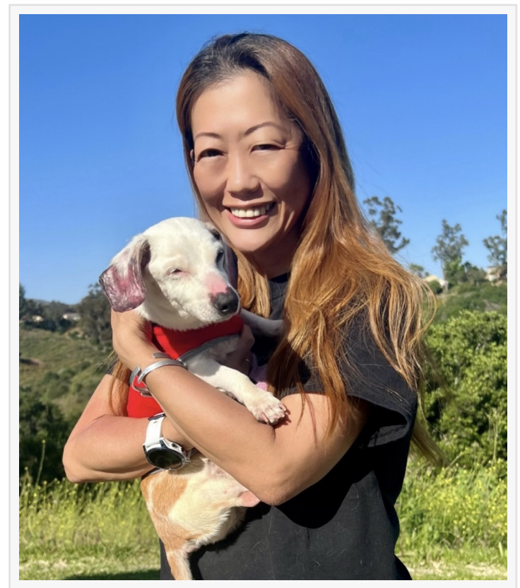
In Home Pet Euthanasia Mobile Veterinarian

1. Comfort: One of the most significant benefits of in-home pet euthanasia is the comfort it provides to both the pet and their owners. The familiar surroundings of home can help reduce anxiety and stress for pets, making the process more peaceful. Additionally, being surrounded by loved ones can provide a sense of comfort and support during a difficult time.