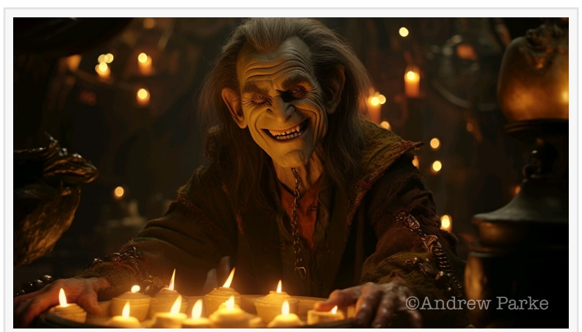
Utilizing Computer visual effects and Artificial Intelligence software, real-life-actors can have their looks transformed for characters in "Journey to Utopia."

"As we move into our business model of feature film productions and video streaming, we are embracing the benefits of working with production