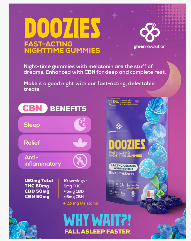
NighTime Doozies CBN Melatonin Edibles Fact Card

Year in and year out, Green Revolution products deliver consistent results, delight consumers, win industry awards, and redefine what a modern cannabis product can be. Green Revolution