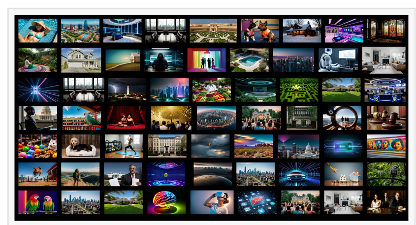
Newsguru's Oddly Compelling Al Generated Picture Gallery

LONDON, UNITED KINGDOM, August 31, 2023 /EINPresswire.com/ -- Newsguru.ai, the leading provider of Al-powered topical web content, is introducing a groundbreaking improvement to its premier content generation service. As part of its daily unique content created for customer