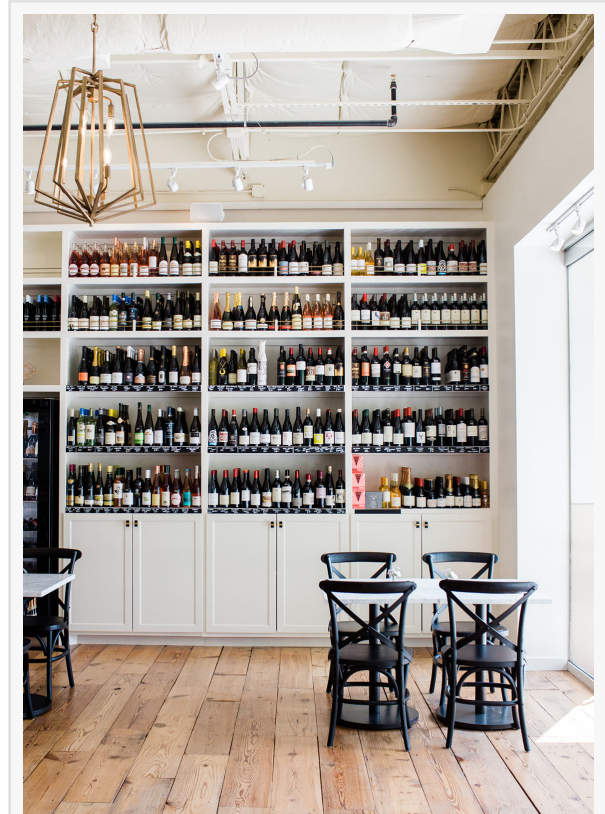
Interior of Trova Wine + Market