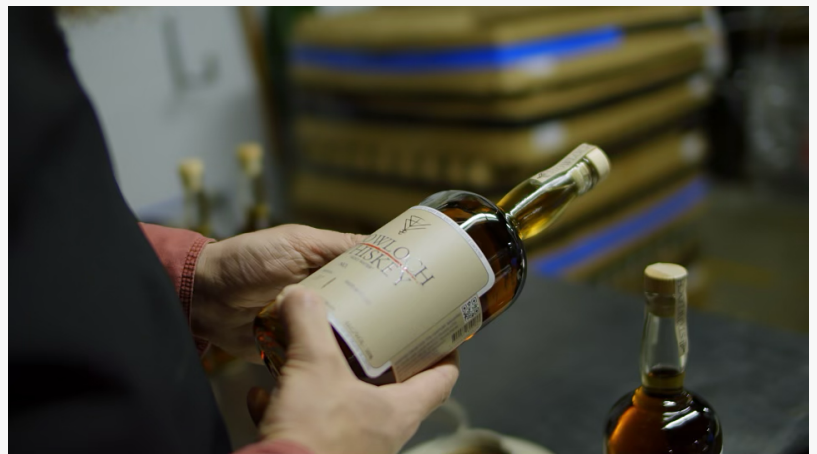
Stowloch Whiskey is proudly made in Missouri's Ozark Highlands