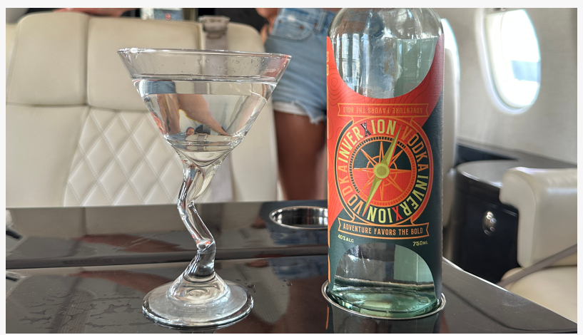
Adventure Favors the Bold!