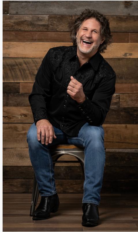
Nashville singer songwriter Ridge Banks