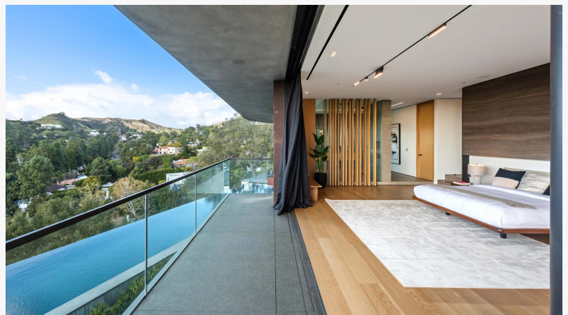
Canyon and ocean views 2 Perched in Beverly Hills' desirable Crest Streets