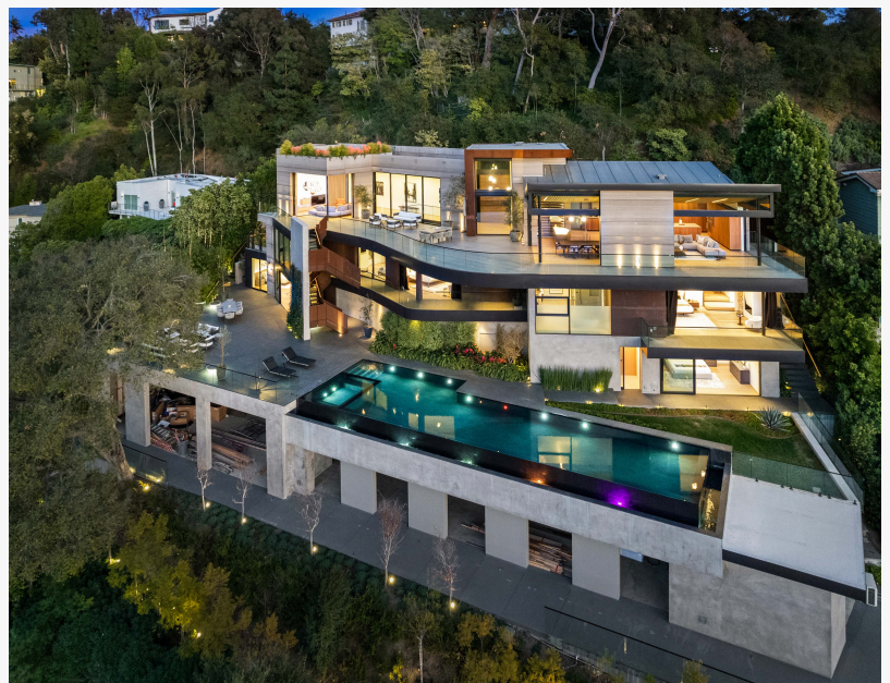
9420 Readcrest Drive | Beverly Hills, CA

Mandana Sarkeshik of Keller Williams Spectrum Properties. Bidding is scheduled to open 7 September and will be available via Concierge Auctions' online marketplace, conciergeauctions.com , allowing buyers to bid digitally from anywhere in the world.