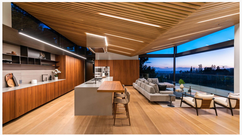
Newly remodeled modern masterpiece by Group S Architects

Agents will be compensated according to the terms and conditions of the Listing Agreement. See Auction Terms and Conditions for full details. For more information, including property details, diligence documents, and more, visit ConciergeAuctions.com or call +1.212.202.2940.