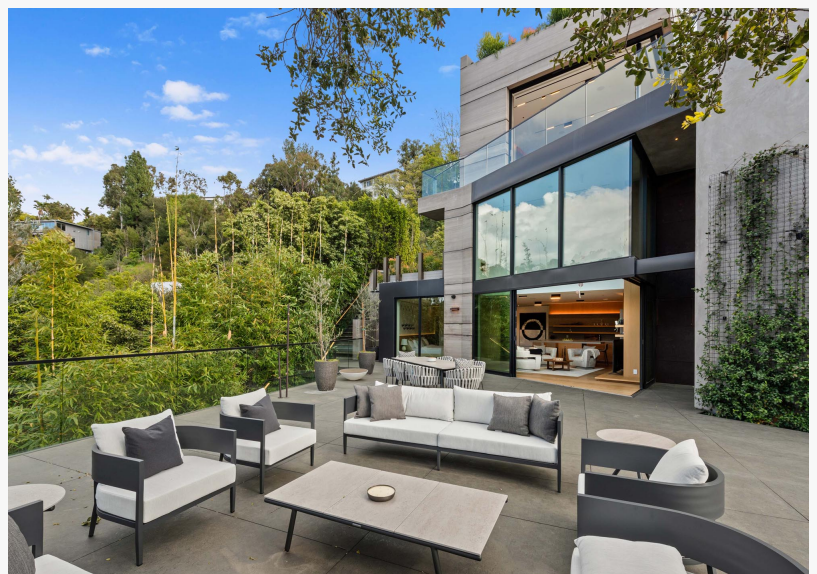
Incredible outdoor space including wrap-around terraces