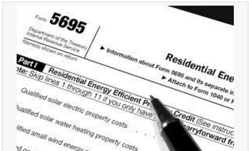
Form 5695 instructions

3. Easy Application: Filing Form 5695 is a straightforward process. A user-friendly guide and