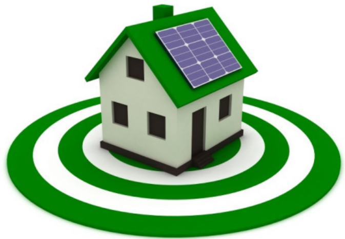
Energy Tax Credits