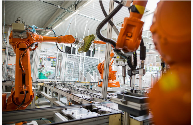
The new event supports National Industry Strategy's ambitious plans to build on 50 investment opportunities in the industrial sector