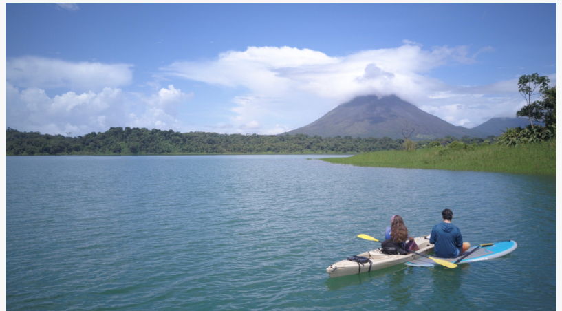
Costa Rica Vacation Spots Arenal

For individuals interested in further details about this expansion or for a deeper understanding