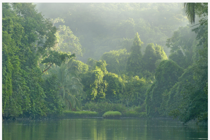
Costa Rica Vacation Spots Corcovado