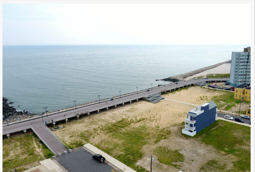
Boardwalk Front Lots

ATLANTIC CITY, NJ, USA, September 5, 2023 /EINPresswire.com/ -- Max Spann Real Estate and Auction Company has posted an additional list of properties up for auction in Atlantic City, New Jersey. Following up on a 65-parcel sale for the City of Atlantic City, the company announced a 100 parcel Multi-Seller Auction , featuring a wide array of properties.