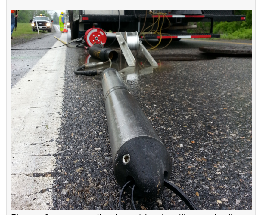
Electro Scan ruggedized machine-intelligent pipeline assessment probe.

In contrast to Acoustic Sensors and CCTV Cameras that cannot locate or quantify leaks in pressurized pipes, Electro Scan technology represents the #1 Solution for Assessing Rising Mains, known in the U.S. as Force Mains.