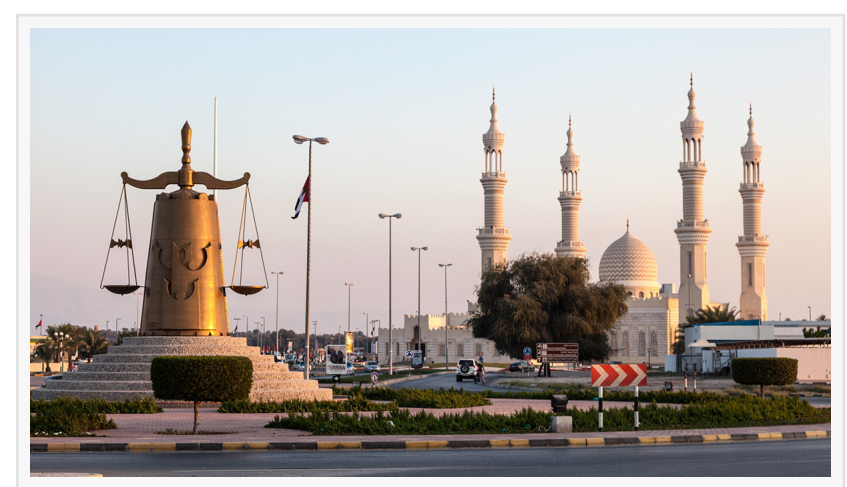
Ras Al Khaimah, United Arab Emirates.

ABU DHABI, UNITED ARAB EMIRATES, September 5, 2023 /EINPresswire.com/ -- Electro Scan Inc. announced today that it has been selected to complete an added sewer inspection project for Ras Al Khaimah Wastewater Agency (RAKWA) working with Abu Dhabibased Applus-Velosi.