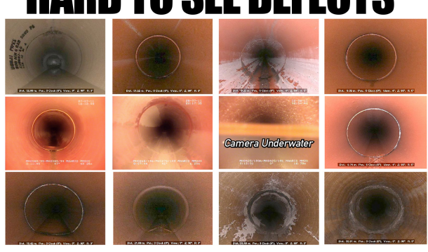
*Leaks Missed By High Resolution CCTV Cameras.

CCTV images that are 'easy' to see obvious defects, and 'difficult' to see showing the limitation of visual inspection to accurately identify leaks.